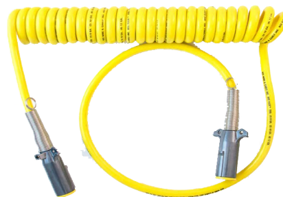
1/8, 2/10, 4/12 GA ISO MODIFIED YELLOW COILED CABLE 12FT WORKING LENGTH 1 ISO PLUG PART NO: TRA38604-12A PRICE: $35.00ea | QTY: 1