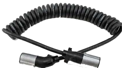
1/2, 6/14 GA 7 CONDUCTOR 12FT WORKING LENGTH COILED CORD ASSEMBLY PART NO: TRA47012 PRICE: $38.75ea | QTY: 1