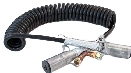
4 GA SINGLE CONDUCTOR 15FT COILED POWER CORD PART NO: TRA38181-15 PRICE: $49.75ea | QTY: 1