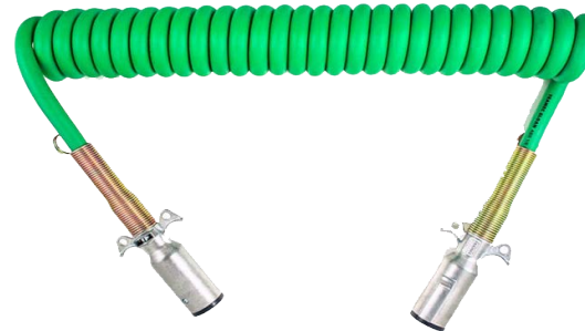
1/8, 2/10, 4/12 GA 7 CONDUCTOR ABS COILED 15FT WORKING LENGTH URETHANE ASSEMBLY NO ZINC PLUGS PART NO: TRA4AA15 PRICE: $84.50ea | QTY: 1