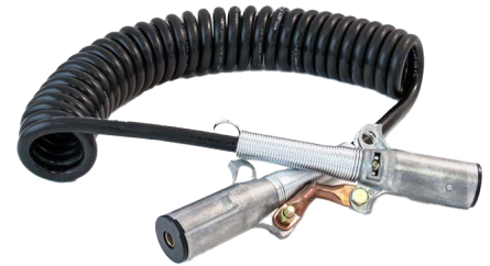
4 GA SINGLE CONDUCTOR 15FT COILED POWER CORD PART NO: TRA38181-15 PRICE: $49.75ea | QTY: 1