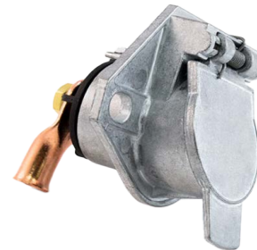
SINGLE POLE PLUG RECEPTACLE PART NO: TRA38491 PRICE: $6.50ea | QTY: 1