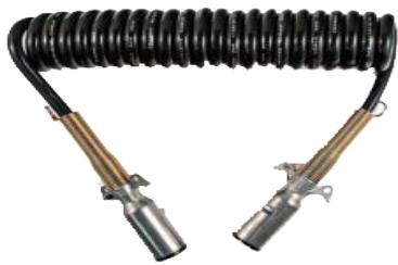
1/12, 6/14 GA CONDUCTOR 12FT COILED CORD ASSEMBLY METAL PLUGS EACH END PART NO: TRA47A12 PRICE: $25.50ea | QTY: 1