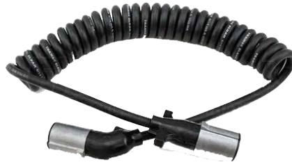
1/2, 6/14 GA 7 CONDUCTOR 12FT WORKING LENGTH COILED CORD ASSEMBLY PART NO: TRA47012 PRICE: $38.75ea | QTY: 1