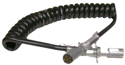
14 GA 6 CONDUCTOR COILED ASSEMBLY W/ZINC PLUGS EACH END 10FT PART NO: TRA38196-10 PRICE: $31.50ea | QTY: 1 12FT PART NO: TRA38196-12 PRICE: $32.75ea | QTY: 1