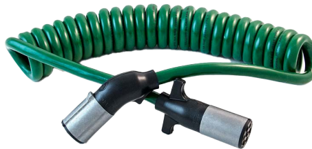
1/8, 2/10, 4/12 7 CONDUCTOR 15FT WORKING LENTH ABS URETHANE GREEN COILED CORD ASSEMBLY PLASTIC PLUGS PART NO: TRA4AC15 METAL PLUGS PART NO: TRA4A015 PRICE(S): $68.50ea | QTY(S): 1