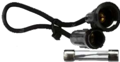
16 GA IN LINE FUSE HOLDER POL52-100 $1.05ea