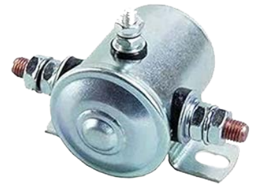
12 VOLT S.P.S.T. GROUNDED 3 TERMINALS CONTINUOUS DUTY SOLENOID SWITCH POL52-312 $13.08ea