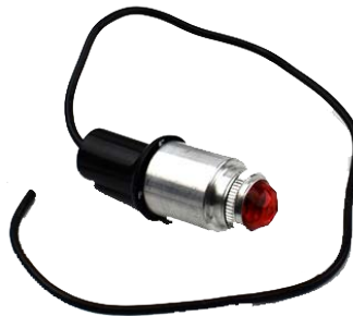
12 VOLT RED PILOT LIGHT POL52-115 $8.54ea