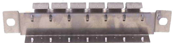
6 GANG MOUNTING BRACKET FOR SNAP IN CIRCUIT BREAKER POL52-242 $3.11ea