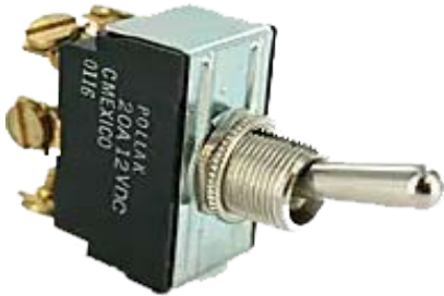
ON-ON 6 BLADE TERMINAL D.P.D.T. 20 AMP 12 VDC TOGGLE SWITCH POL34-576Q $6.00ea