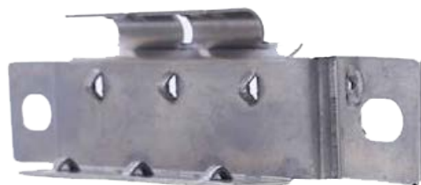
2 GANG MOUNTING BRACKET FOR CIRCUIT BREAKERS POL52-240 $2.65ea