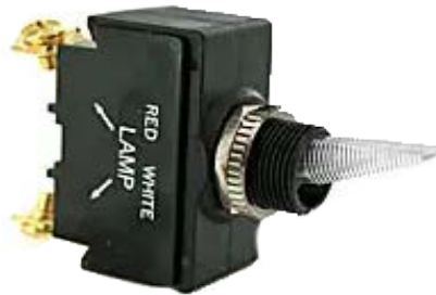
MOM ON-OFF-ON 6 BLADE TERMINAL D.P.D.T. 20 AMP 12 VDC TOGGLE SWITCH POL34-578Q $8.08ea