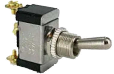
MOM ON-OFF-MOM ON 3 BLADE TERMINAL S.P.D.T. 20 AMP 12 VDC TOGGLE SWITCH POL34-575Q $5.56ea