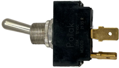
ON-OFF D.P.S.T. 4 BLADE TERMINAL 20 AMP 12 VDC TOGGLE SWITCH POL34-574Q $4.95ea