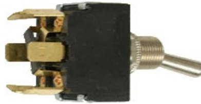
MOM ON-OFF-MOM ON 3 SCREW TERMINAL S.P.D.T. 20 AMP 12 VDC TOGGLE SWITCH POL34-575 $5.88ea